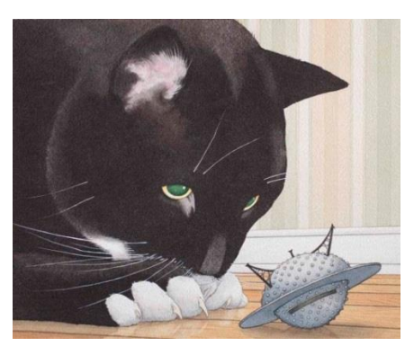
Left: David Wiesner, Flotsam , pg. 19, 2006. Watercolor on paper. Courtesy of the artist. Right: David Wiesner, Mr. Wuffles! , pg. 8, 2013. Watercolor and india ink on paper. Courtesy of the artist.

The exhibition and catalogue provide an overview of the career of the Caldecott Award—winning artist, so that visitors both familiar and unfamiliar with Wiesner's achievements can appreciate these handwrought works of art that are the basis of his bestselling picture books. The charm of these wordless narratives is apparent; but the actual process by which Wiesner achieves this seemingly effortless effect of visual wit is not often fully apprehended, especially if limited to the reproductions of the illustrated books. Viewing the original works reveals the multiple layers of watercolor that he uses to create the opaque, exquisitely nuanced hues that bring each piece to life. The disparity between the slowness of the images' creation and the seeming instantaneity of the digitally produced reproductions that pop from the corresponding pages of Wiesner's picture books presents a somewhat paradoxical effect. It is, perhaps, not unmeaningful that a like disparity has often been pointed out in the work of Magritte, Dalí, and Giorgio de Chirico, whose oneiric images are far from spontaneous apparitions, but rather heavily calculated, technical works of labor.